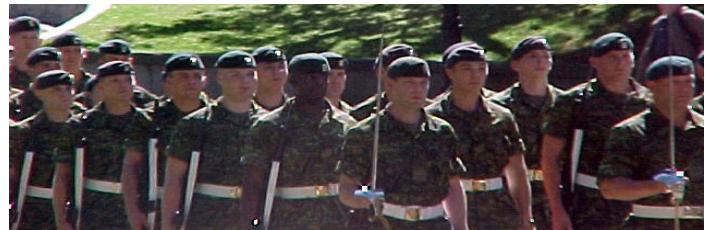
A Coy marches onto the Grand Parade

The Princess Louise Fusiliers exercised their right to the Freedom of the City of the Halifax Regional Municipality on Saturday 14 September 2002. Following rehearsals in the Armouries in the morning, the Regiment stepped off from the Armouries parade square shortly after 1 pm en route to Old City Hall. Escorted through the streets by the HRM Police Dept, and led by a small ensemble from the 36 CBG Band, the PLF in two companies with the Regimental Colour marched from the Armouries to the Grand Parade, there to await the arrival of the Mayor for His Honour's annual inspection.